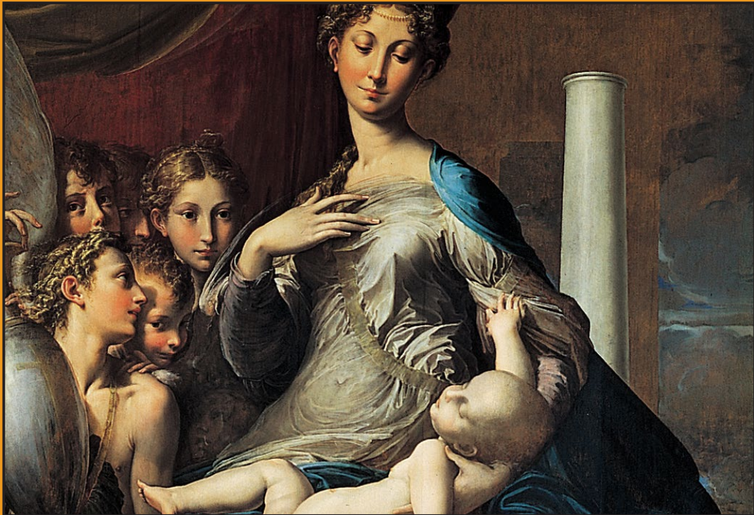
Parmigianino, Madonna dal collo lungo , 1534-1540, Galleria degli Uffizi, Firenze (detail).