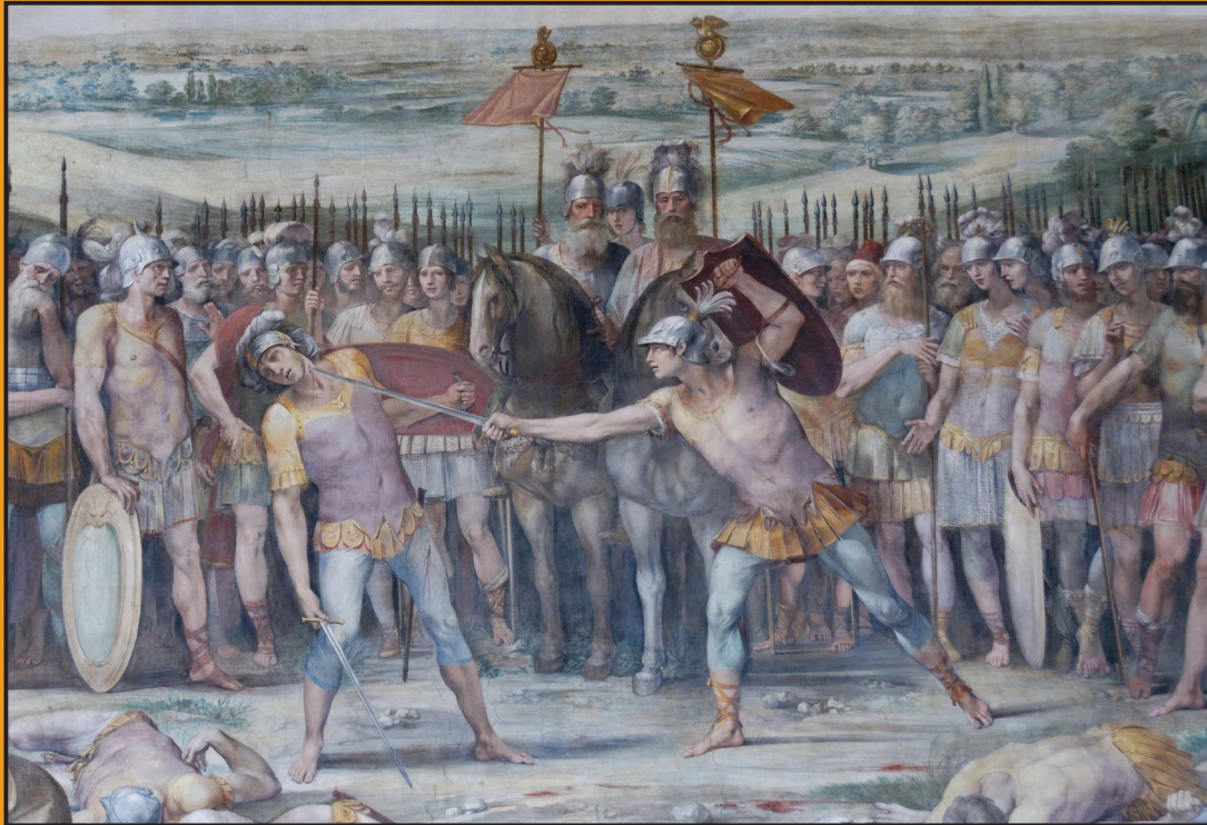
Giuseppe Cesari, Combattimento degli Orazi e dei Curiazi , Affresco 1612-1613, Musei Capitolini, Roma.