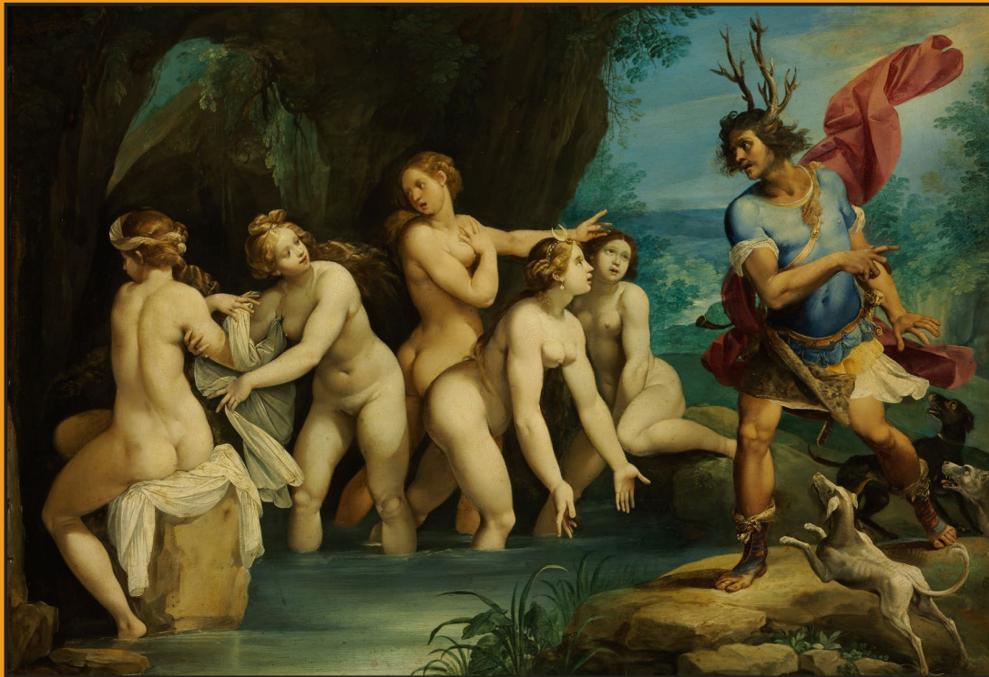
Giuseppe Cesari, Diana e Atteone , 1602-03 circa, Museo di Belle Arti, Budapest.