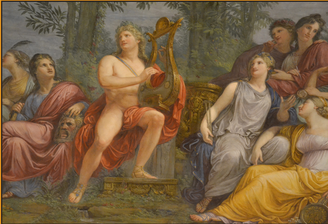
Andrea Appiani, Parnaso , affresco, 1811, Villa reale, Milano.