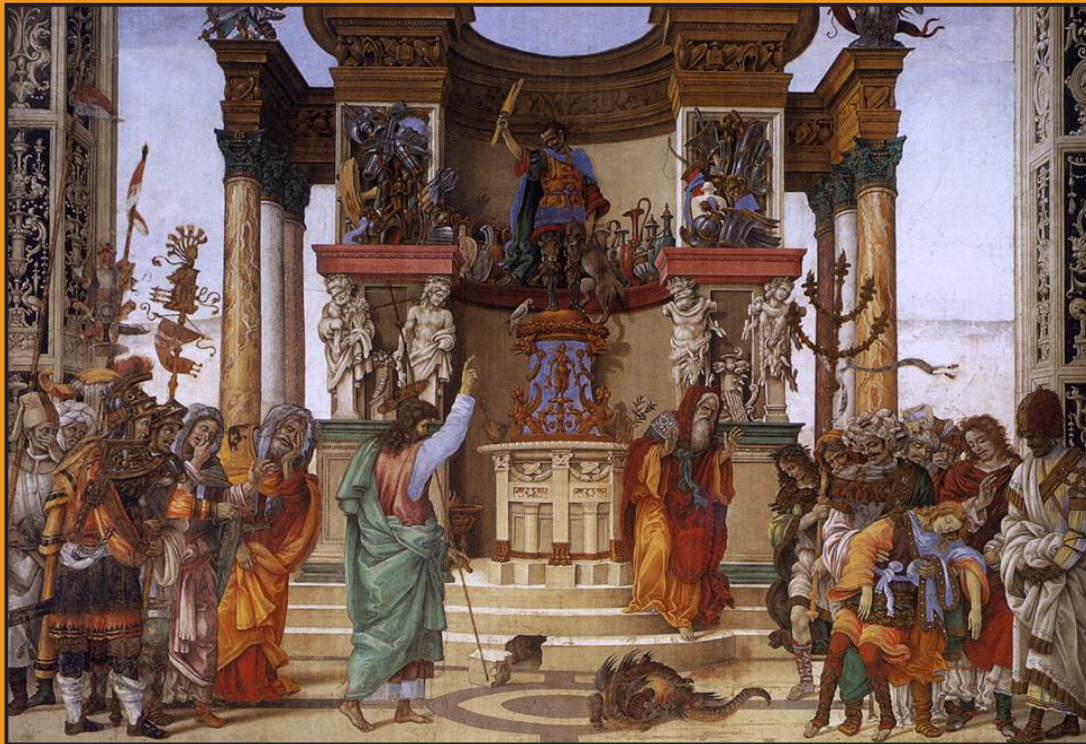
Filippino Lippi, San Filippo scaccia il drago dal tempio di Marte , affresco 1487-1502 - Basilica di Santa Maria Novella, cappella di Filippo Strozzi, Florence, Italy (detail).