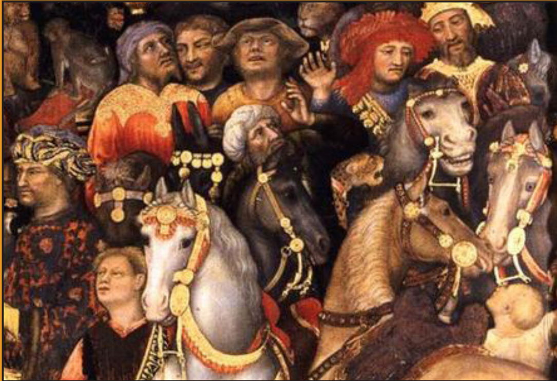
Gentile Da Fabriano, Adorazione dei Magi , tempera, 1423 - Galleria degli Uffizi, Florence, Italy (detail).